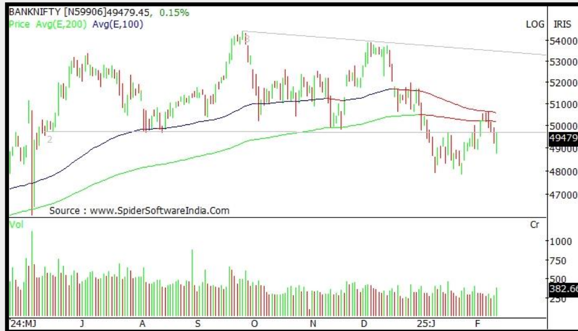
Daily Chart (49,479.45)