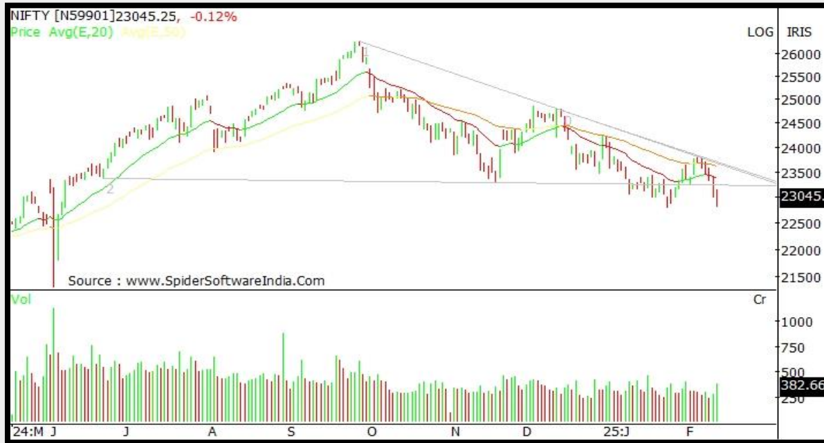
Daily Chart (23,045.25)